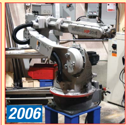
MOTOMAN HP20-6, 6 AXIS ROBOT