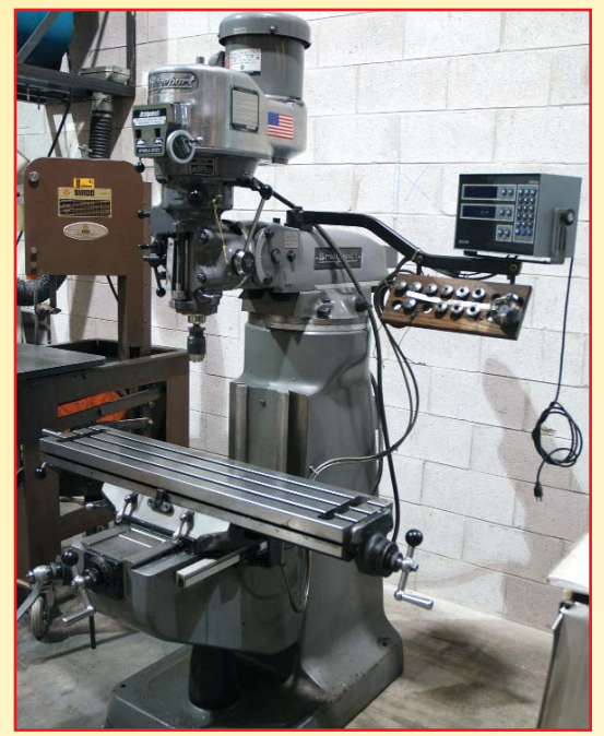
BRIDGEPORT SERIES 1 MILL