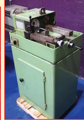
DME PRECISION PIN CUT OFF & GRINDING MACHINE MODEL PPC750