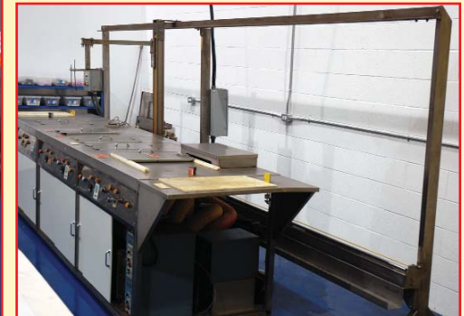
CREST ULTRASONIC 5 STATION ROBOTIC DIPPING LINE