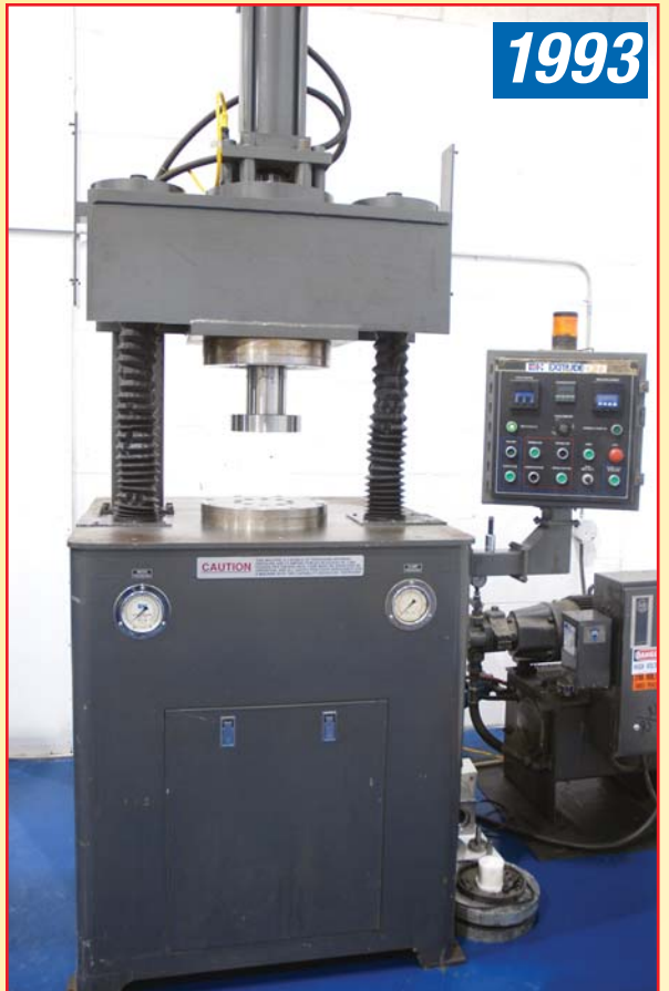
EXTRUDE HONE VECTOR 8/6