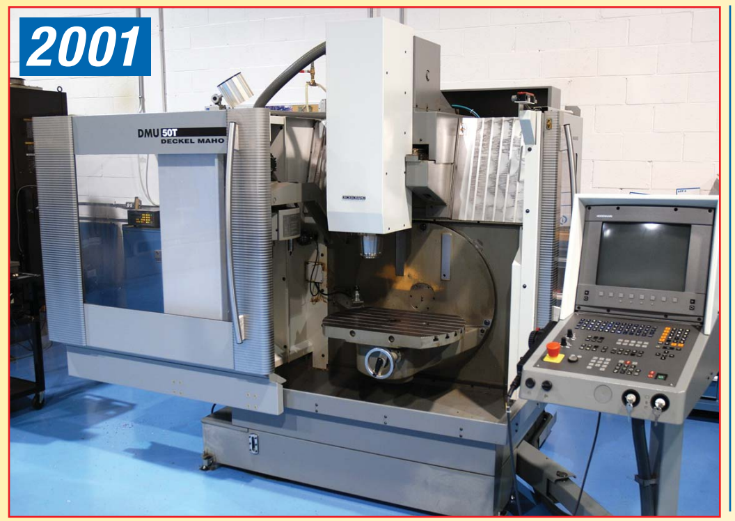
DECKEL DMU 50T CNC VERTICAL MACHINING CENTER