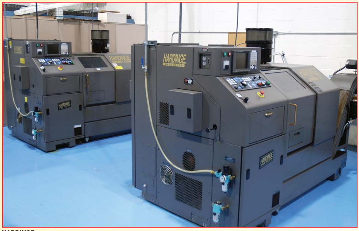
HARDINGE CONQUEST GT, MODEL CS-GT CNC LATHES