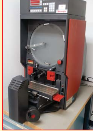
STARRET COMPARATOR MODEL HB400

This brochure is only a partial listing. Please visit our websites at www.infassets.com for more detailed listings and photos.