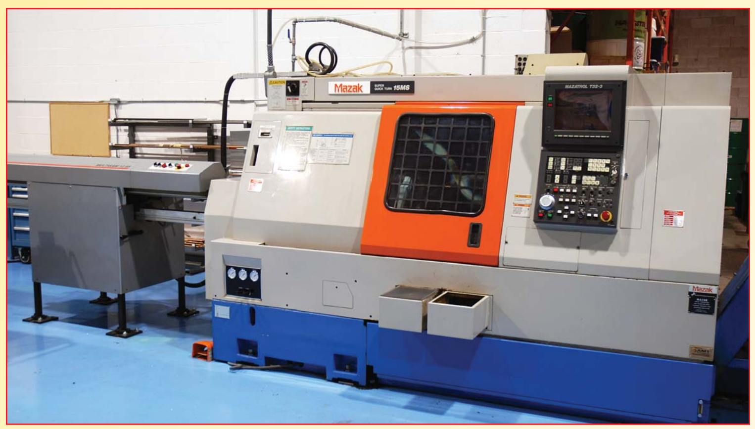
MAZAK MODEL SQT -SUPER QUICK TURN 15MS CNC LATHE, INTERFACED WITH SAMECA MULTISAM 12.65 BAR FEED