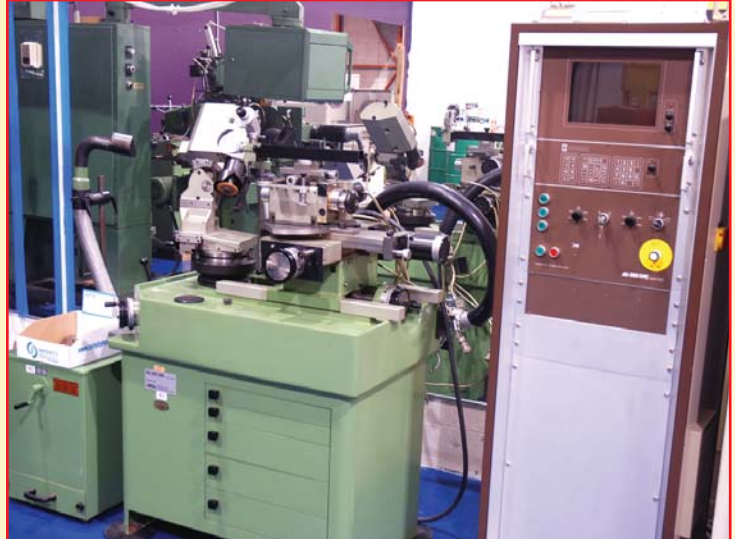
CHRISTEN MODEL AU-250 CNC - TOOL GRINDER

This brochure is only a partial listing. Please visit our websites at www.infassets.com for more detailed listings and photos.