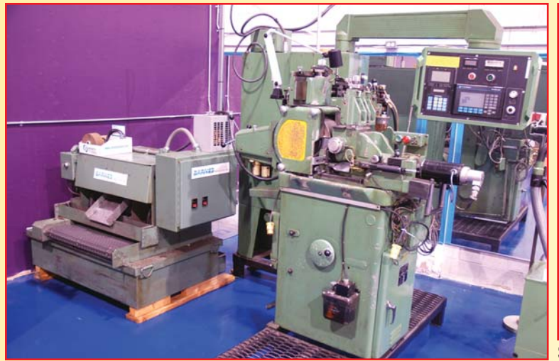
ROYAL MASTER MODEL CG-12X4 CNC CENTERLESS GRINDER