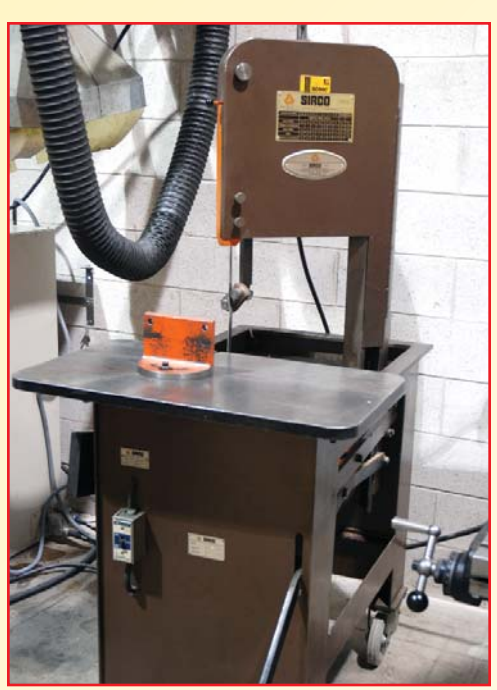
SIRCO ROLL IN BANDSAW