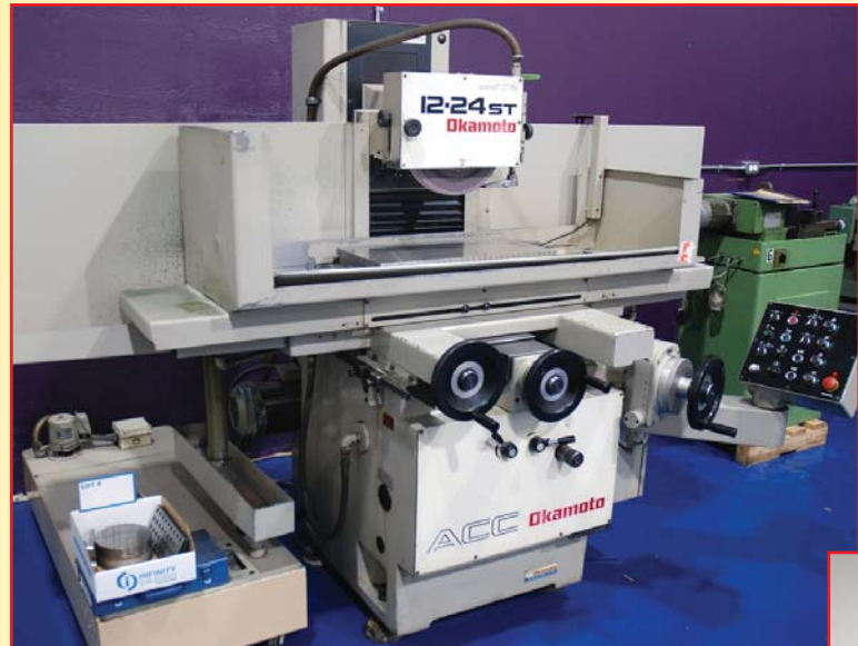
ACC OKAMOTO MODEL ACC-12.24ST, 12"X24" SURFACE GRINDER